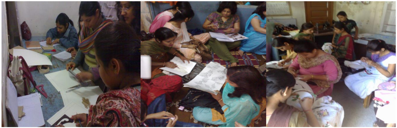
View of Cutting Tailoring & Dress Making at NITT