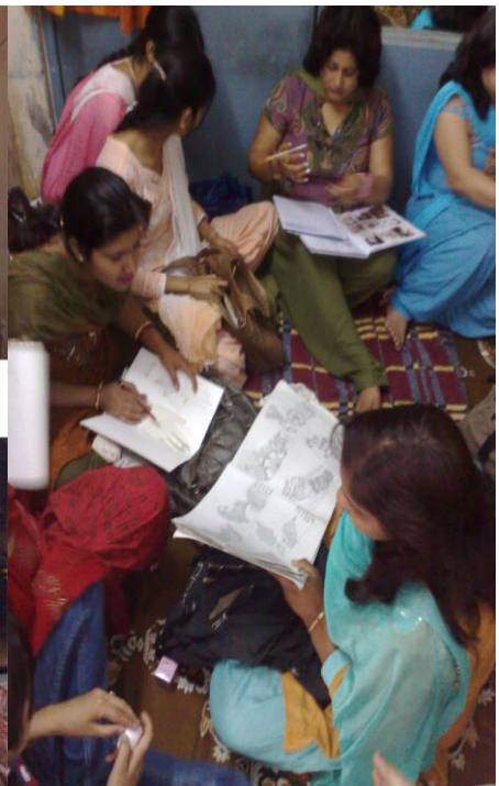
VIEW OF FASHION DESIGNING CLASS ROOMS